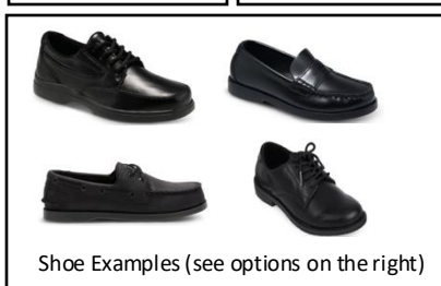
Shoe Examples (see options on the right)