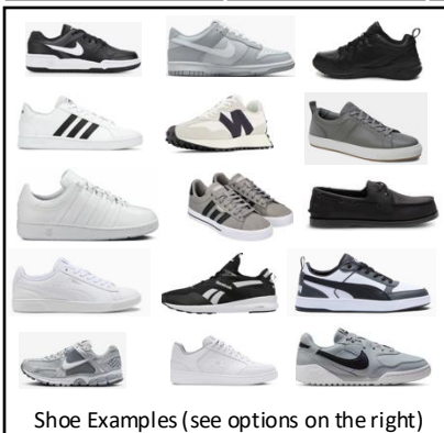
Shoe Examples (see options on the right)